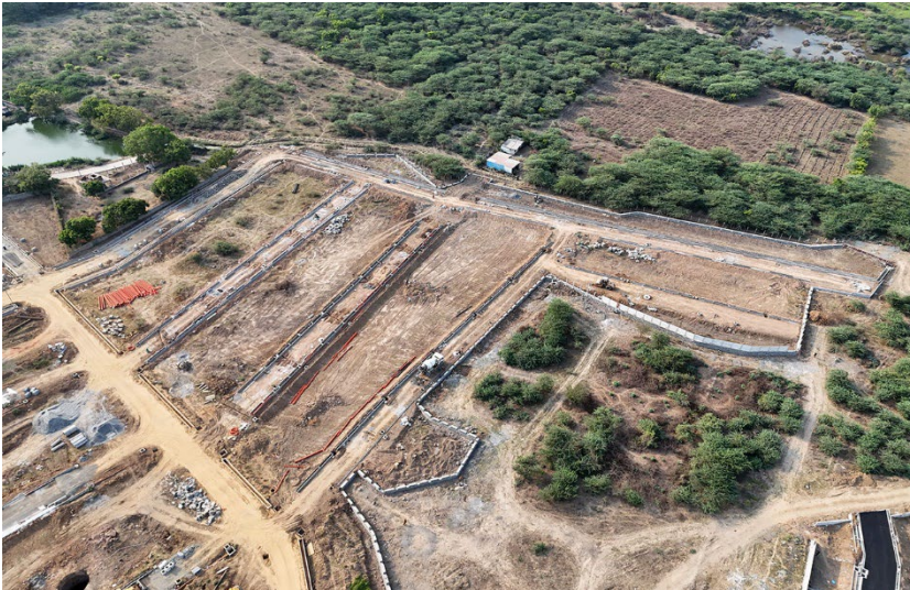
ZONE-3 Kerbstone work in progress. Completion of storm water box drain.