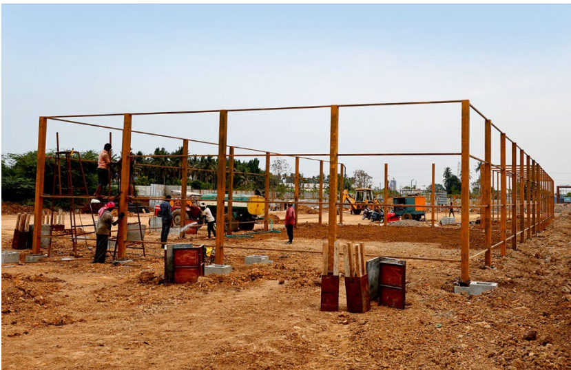
Basketball court Structural steel work in progress.