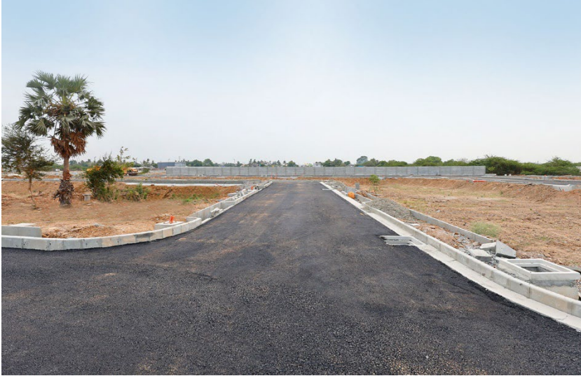
ZONE-4 - C27-7.2M Road Kerbstone, irrigation, plantation, plot entry ramp & road work-up to DBM completed.