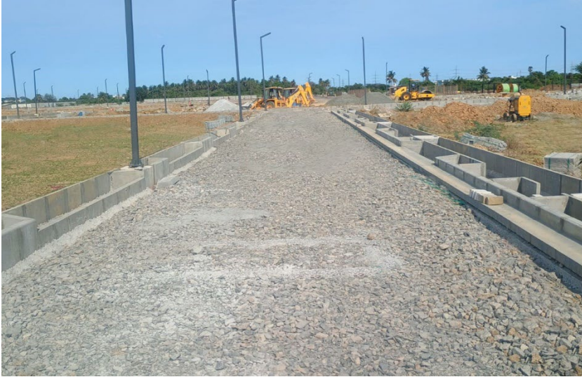
ZONE-2 C8-7.2M Road Kerbstone, irrigation work in progress. Road up to GSB completed. Electrical work in progress.