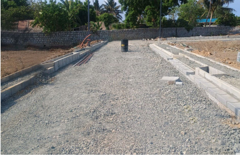
ZONE-2 - C10-7.2M Road Kerbstone, irrigation work in progress. Road up to GSB completed. Electrical work in progress.