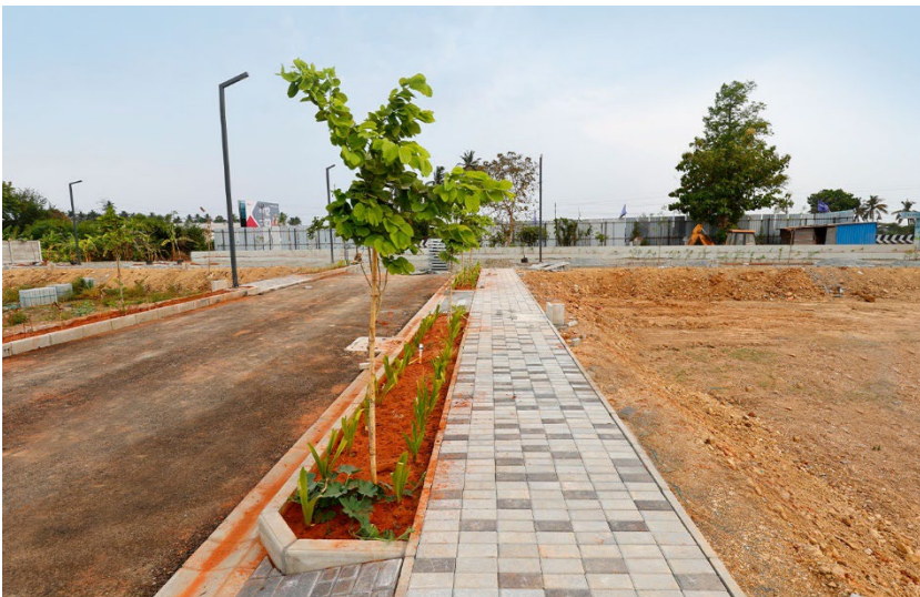
ZONE-1 Typical view of footpath paver Typical view of plantation works