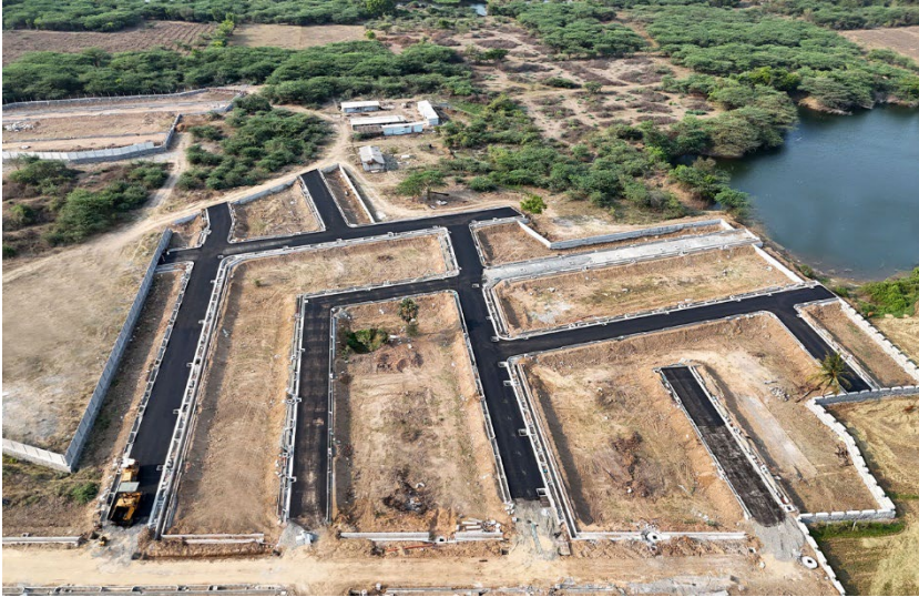
ZONE-4 Completion of DBM 13/15. Paver work in progress.