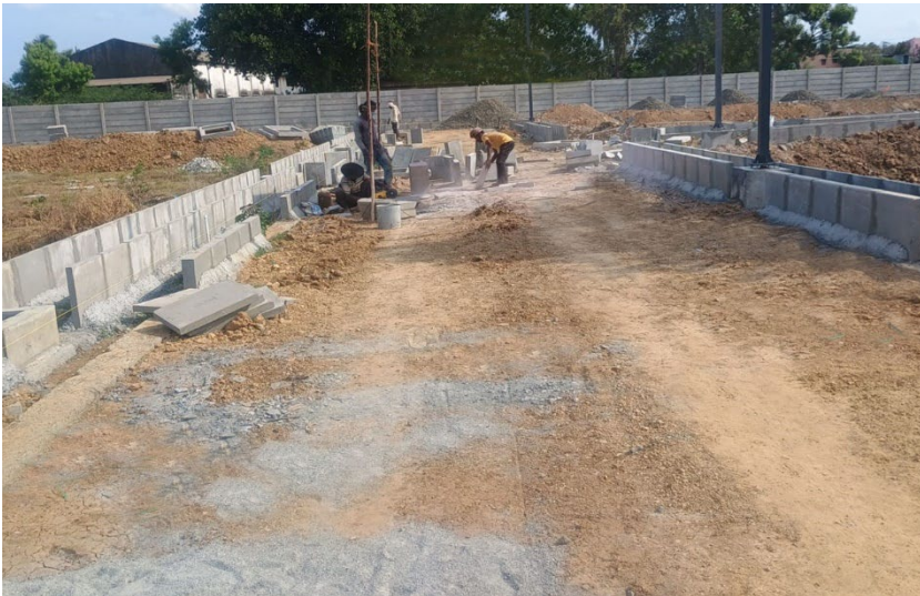
ZONE-2 - C5-7.2M Road Kerbstone, irrigation work in progress. Electrical work in progress.