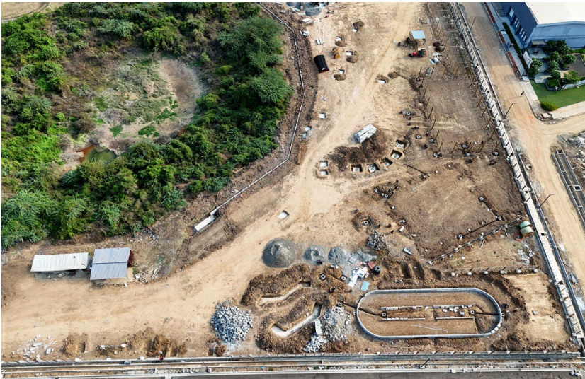
OSR Part 1 Cricket pitch - 40% completed. Screen wall – 10% completed. Skating rink - 50% completed. Mini soccer - 45% completed. Basketball court - 20% completed. Informal seating - 5% completed.