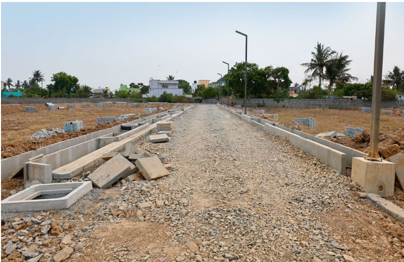
ZONE-2 - C11-7.2M Road Kerbstone, irrigation work in progress. Road up to GSB completed. Electrical work in progress.