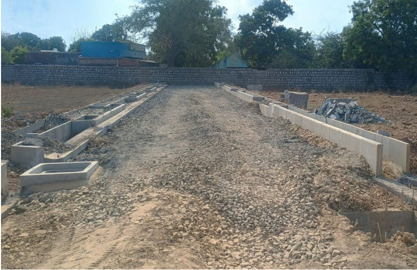
ZONE-2 - C12-7.2M Road Kerbstone, irrigation work in progress. Road up to GSB completed. Electrical work in progress.