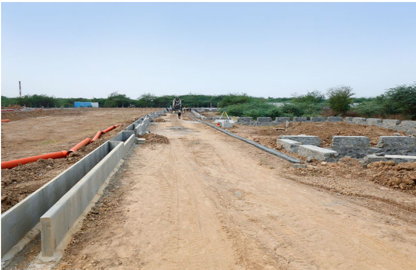
ZONE-3 - C15-7.2M Road Soil filling completed. Kerbstone work & electrical work in progress.