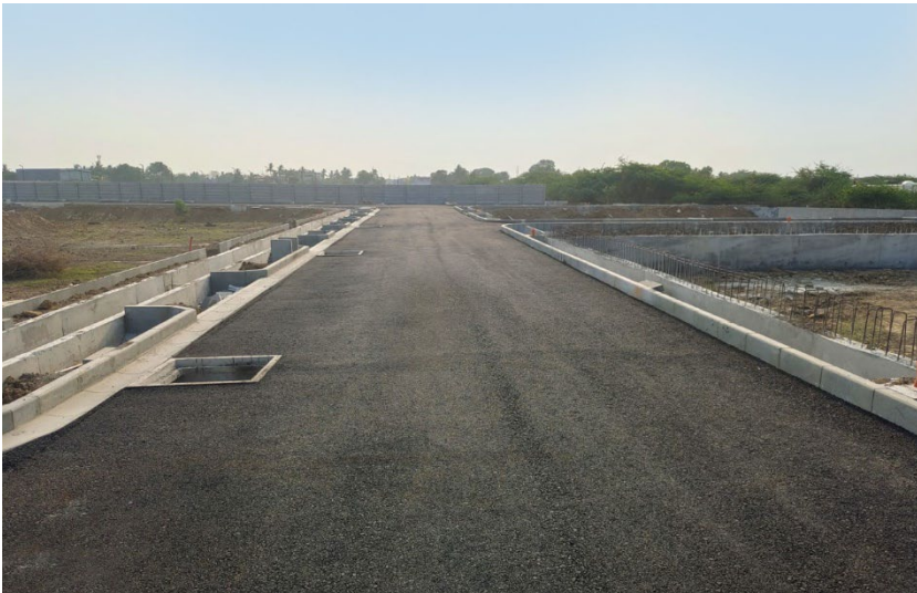
ZONE-4 - B8-9M Road Kerbstone, irrigation, plantation, plot entry ramp & road work—up to DBM completed.