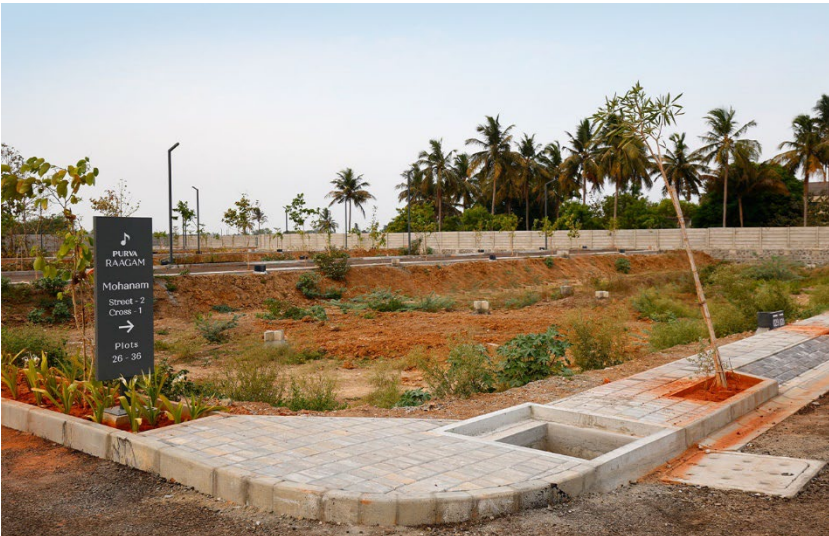
ZONE-1 Typical view of street signage