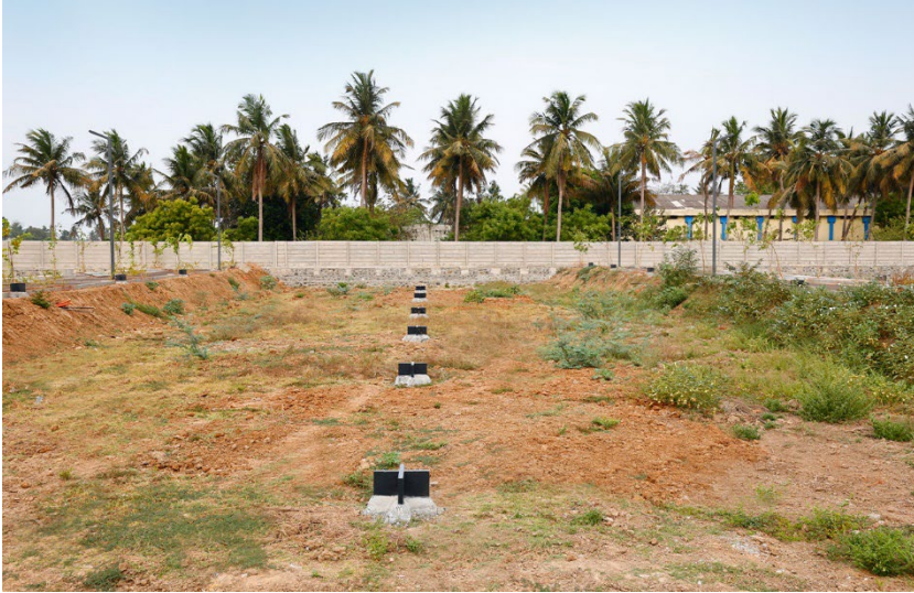
ZONE-1 Typical view plot corner stone