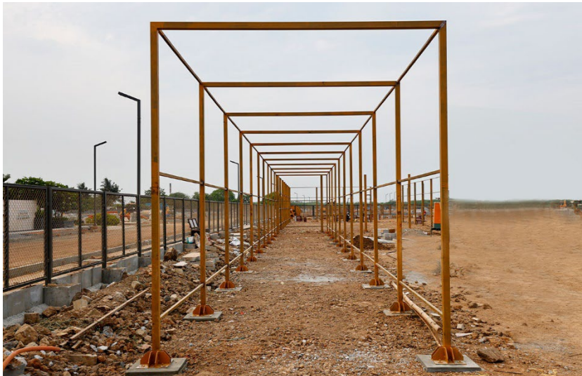
Cricket Pitch Structural steel work completed.