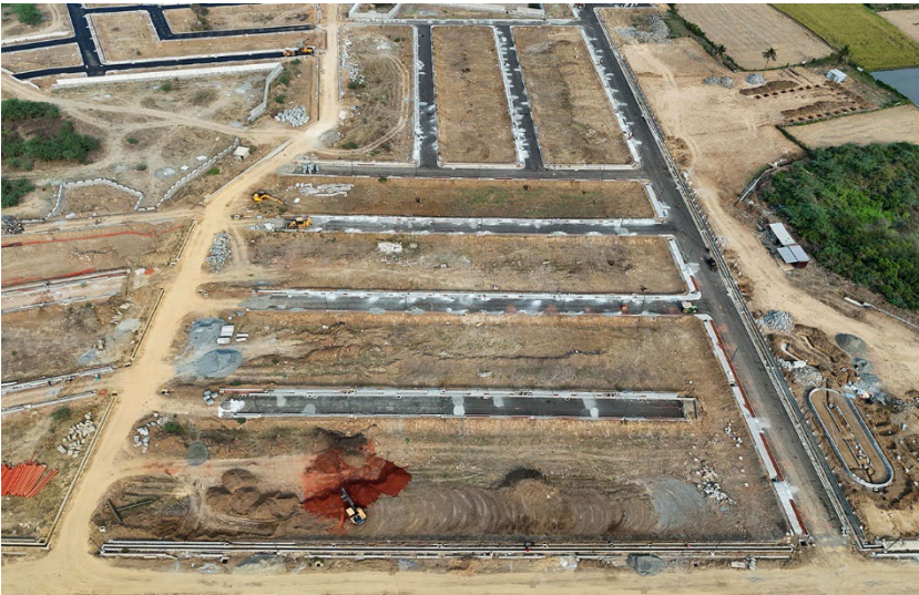
ZONE-5 Completion of DBM 6/6. Paver work in progress.