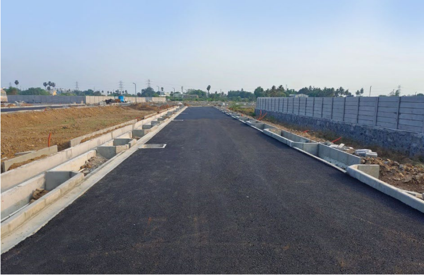
ZONE-4 - B9 - 9M Road Kerbstone, irrigation, plantation, plot entry ramp & road work—up to DBM completed.