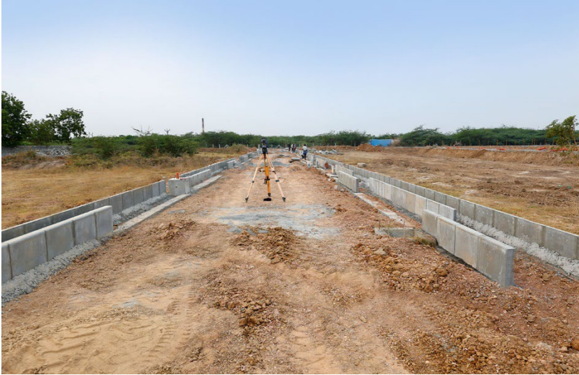
ZONE-3- C14-7.2M Road Soil filling completed. Kerbstone work & electrical work in progress.