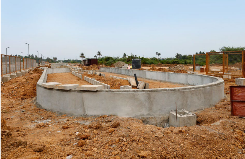
Skating rink Peripheral wall completed.