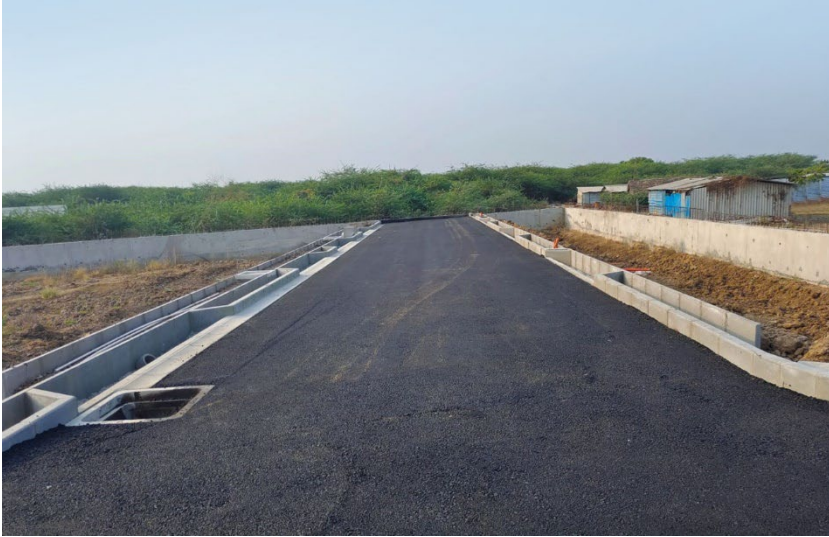
ZONE-4 - C32-7.2M Road Kerbstone, irrigation, plantation, plot entry ramp & road work—up to DBM completed.