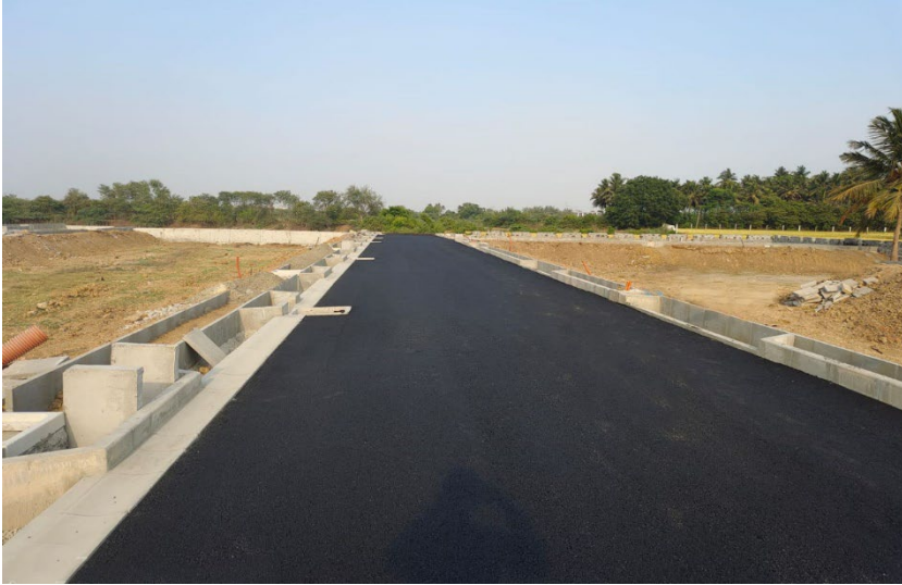
ZONE-4 - C31-7.2M Road Kerbstone, irrigation, plantation, plot entry ramp & road work-up to DBM completed.