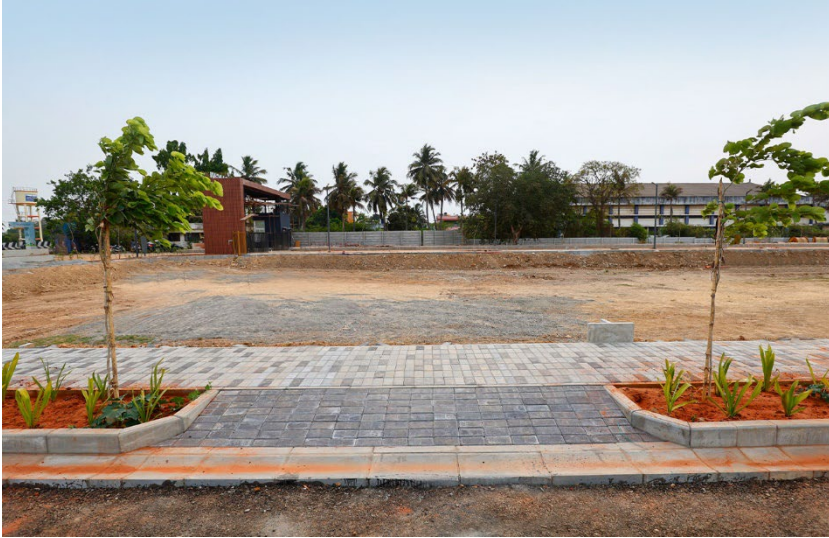
ZONE-1 Typical view of plot entry ramp