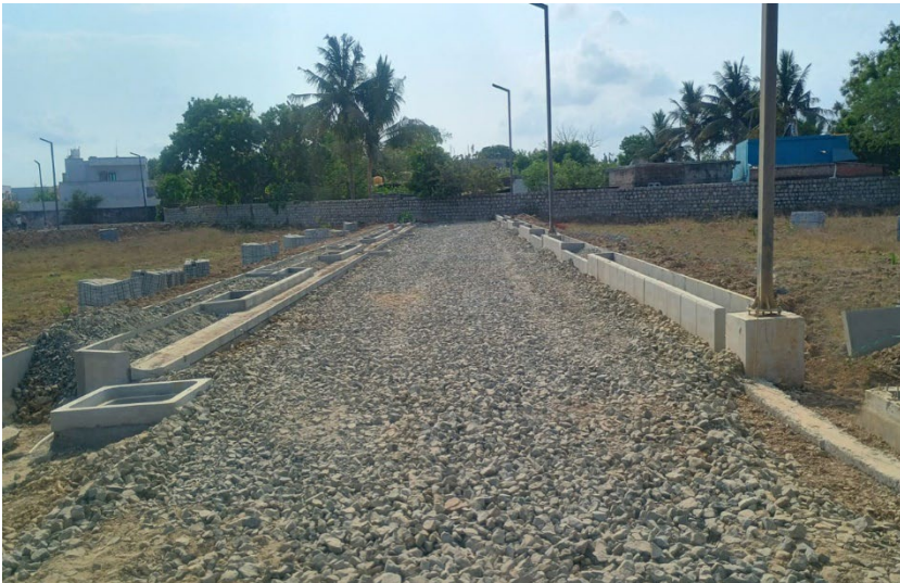
ZONE-2 - C13-7.2M Road Kerbstone & irrigation work in progress. Road up to GSB completed. Streetlight installed. Electrical work in progress.