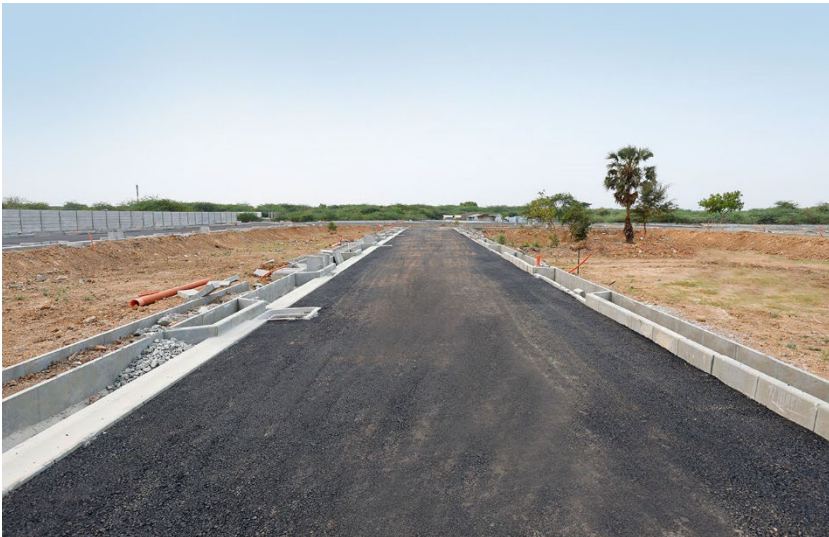
ZONE-4 - C28-7.2M Road Kerbstone, irrigation, plantation, plot entry ramp & road work-up to DBM completed.