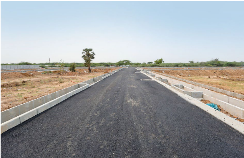
ZONE-4 - C29-7.2M Road Kerbstone, irrigation, plantation, plot entry ramp & road work-up to DBM completed.