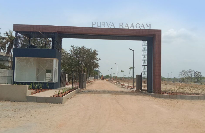
Entrance portal Finishing work in progress.