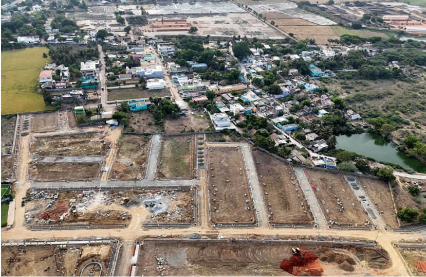
ZONE-2 Kerbstone – 5/12 GSB - 5/12 Completion of GSB-5 roads