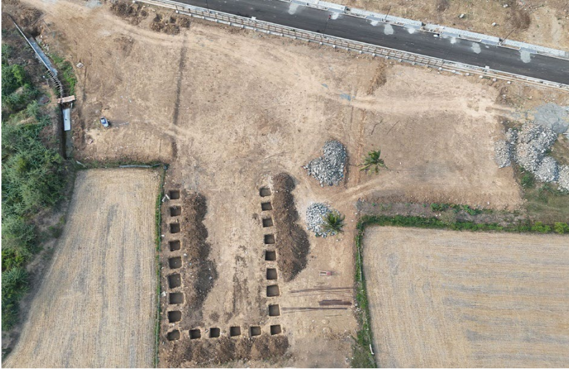
OSR Part 2 Multipurpose court - 5% completed.