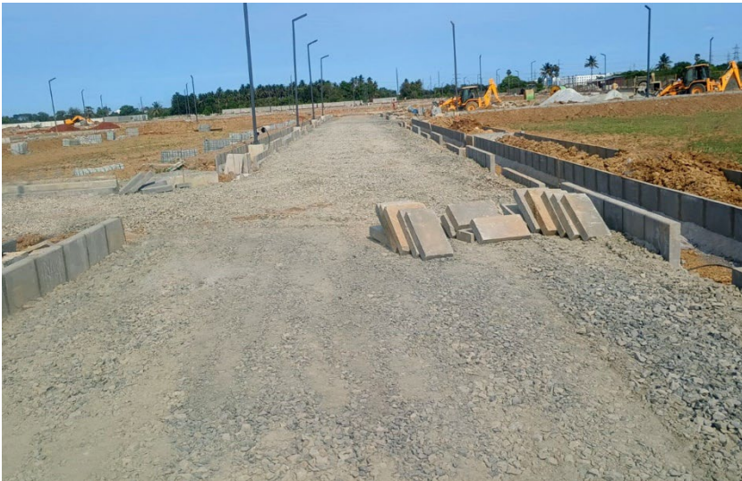
ZONE-2 C9-7.2M Road Kerbstone, irrigation work in progress. Road up to GSB completed. Electrical work in progress.